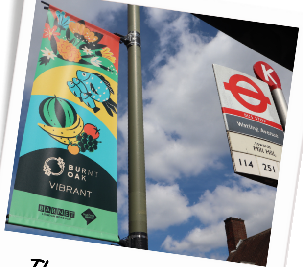
Their work on display

We have participated in an array of workshops - young people have been part of documentaries, designed the new Burnt Oak logo and banners, as well as designs for iron plaques that will be installed in and around the parklets for a decade. Several of these projects have now been completed and we are now seeing young people's work being erected in and around Burnt Oak.