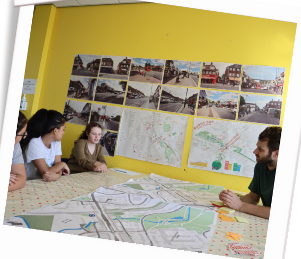
Our local area