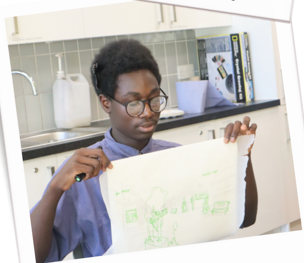
The design phase