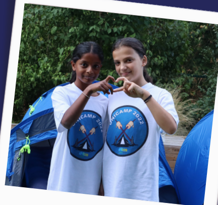
I ❤️ Camping