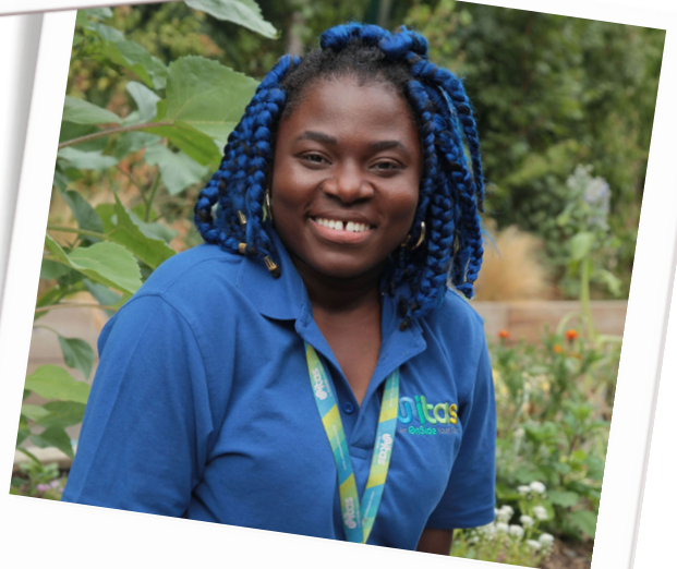
Our Junior Lead